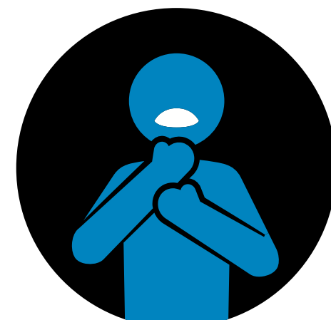
Shortness of Breath